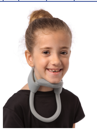
Pediatric Headmaster Collars are softer and may be fitted to children as young as 6 months.