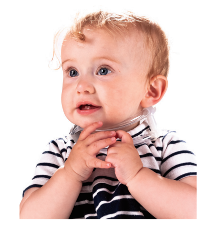
CAUTION: Do not leave a child unattended while wearing this Collar!

Fit the Collar loosely at first and ensure that the lateral tubes are the correct length and on the correct side. Snug up the Collar by hand to check the fit.