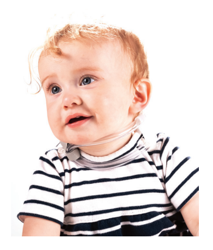
Use the TOT Collar with a stretching regime for best results.